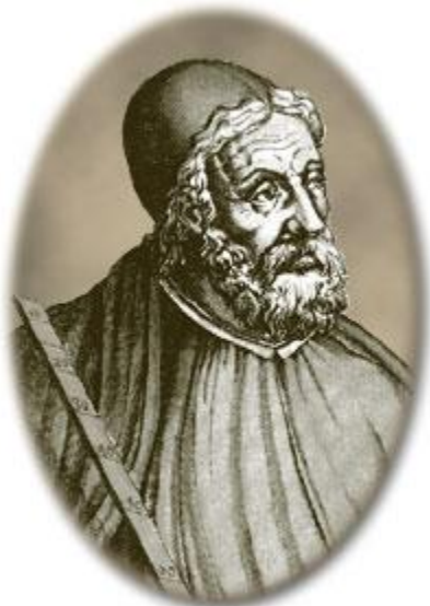
Claudius Ptolemy (87-150)