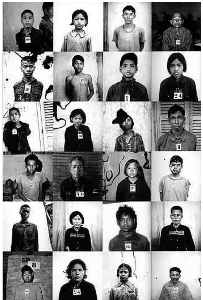
Victims of the Cambodian Genocide

The United Nations was given a mandate to enforce a ceasefire, and deal with refugees and disarmament. Norodom Sihanouk was reinstated as King of a constitutional monarchy. A coalition government, formed after national elections in 1998, brought renewed political stability and the surrender of remaining Khmer Rouge forces in 1998. Compared to its recent past, the 1993–2003 period has been one of relative stability for Cambodia. However, political violence continues to be a problem. Cambodia is moving past its war torn history and focusing on national reconstruction. In recent years, the country has seen double digit economic growth, and seeks foreign business investment to modernize the nation and eliminate poverty.