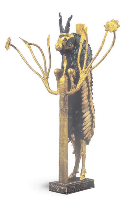
▲ This gold and lapis ram with a shell fleece was found in a royal burial tomb.

Sumerians built impressive ziggurats for them and offered rich sacrifices of animals, food, and wine.